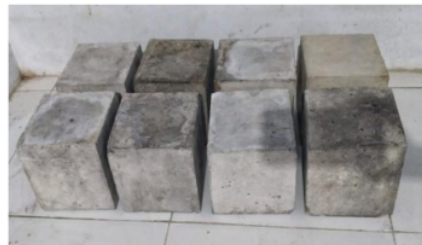
Figure 2. Specimens curing in laboratory