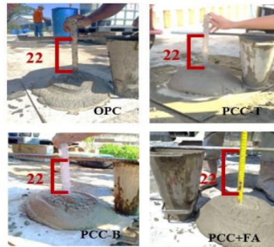
FIGURE 1. Fresh foam concrete slump test results

Figure 1 shows the value of the foam concrete slump test results from all the mixtures used under fresh conditions. The average slump value in all mixtures is 22cm and visual observation reveals that the fresh concrete mix from each mix design is adhesive, indicating that no segregation or bleeding has occurred.